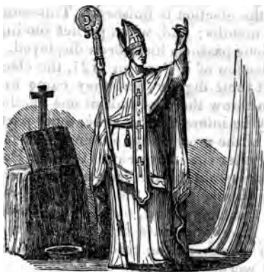
THE POPE, AS BISHOP OF ROME.

POPE. —These succeeded to office, not by any graduation, but owe their preferment to election. The office once conferred, is for life. The election is in the cardinals. A Pope is not a high-priest, but an earthly prince also, so