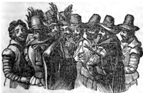
Bates. E. Winter. C. Wright. Percy. Fawkes. Catesby. T. Winter. J Wright.