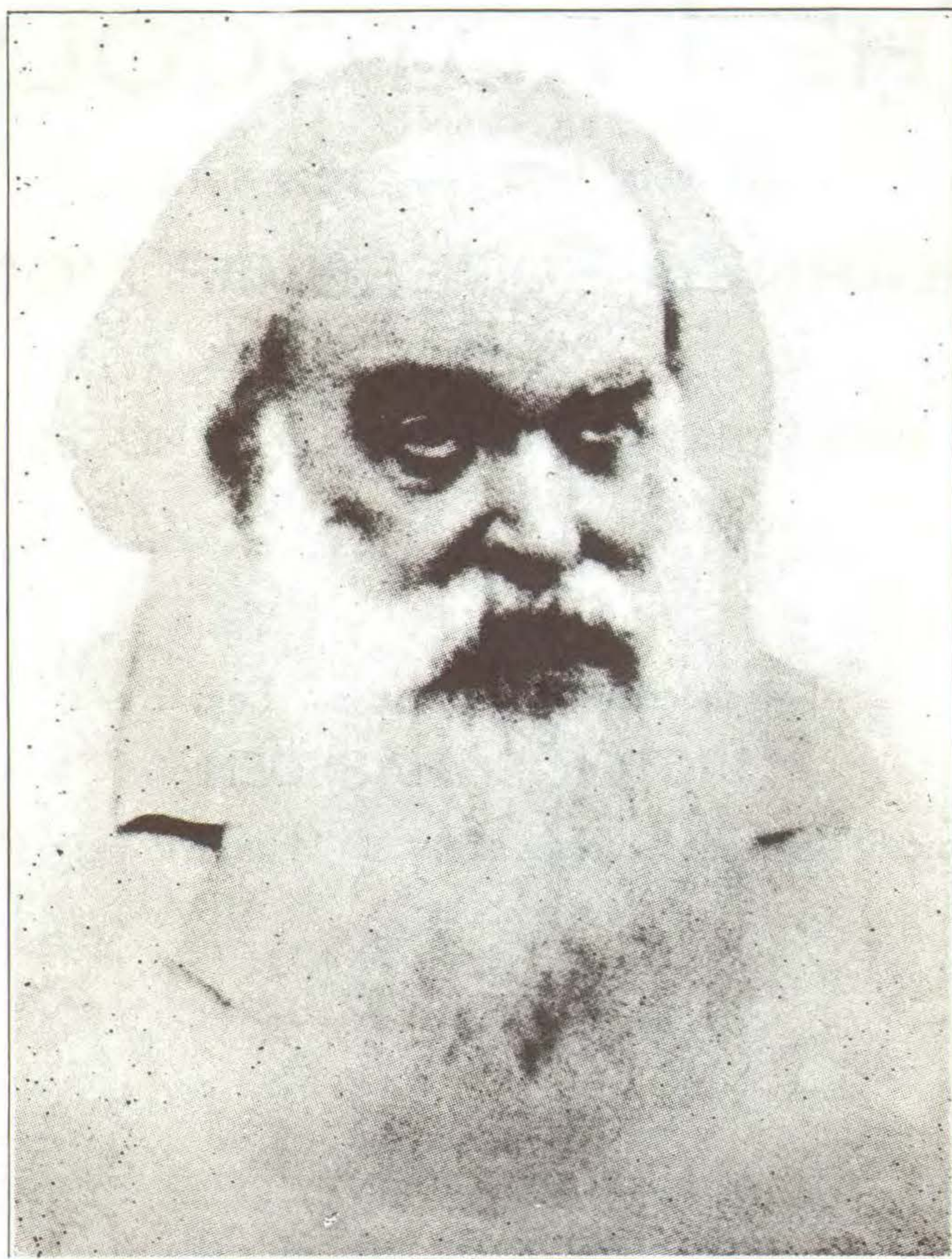
Sergius A. Nilus First Publisher of "The Protocols" 1901