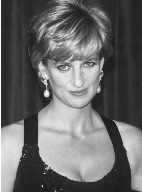
Not all Normans were mean and ugly. Diana, princess of Wales, a noted philanthropist, by birth was of the Spencer family of Normans.

I began in 2004 my own voyage into that part of my own