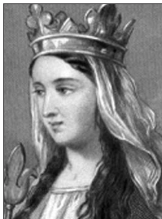
MATILDA OF FLANDERS William's queen.