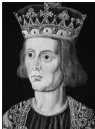
KING WILLIAM II (RUFUS) Cruel and heartless ruler.