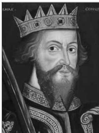
KING WILLIAM I Psychopathic despot.