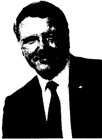
JAMES "BO" GRITZ

The Time is Now—Let's Take America Back From the "Republicrats" Who Have Brought Our Nation to the Brink of Ruin