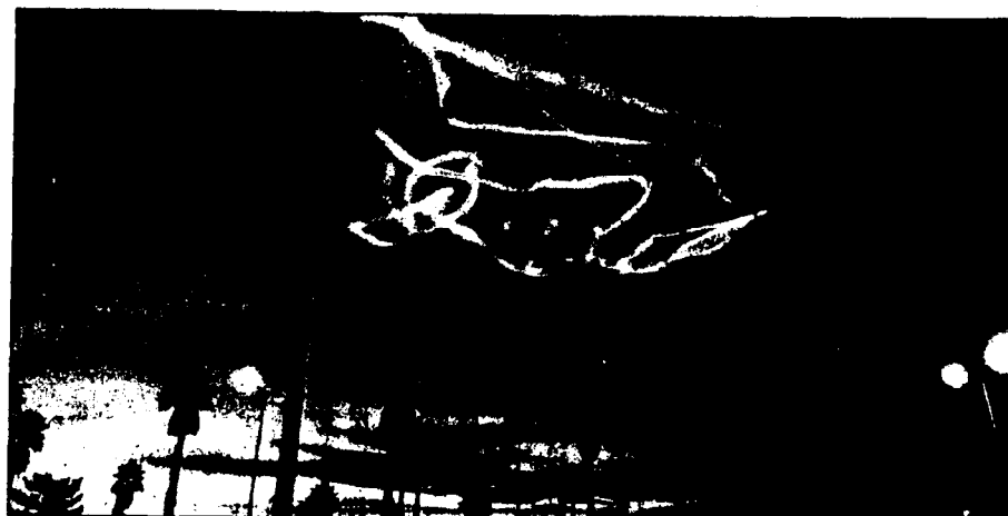
A contrail is left by a rocket, carrying an SDI satellite, that was launched from Vandenberg Air Force Base.

10-NEWS / SUNDAY, NOVEMBER 22, 1992 / DAILY NEWS