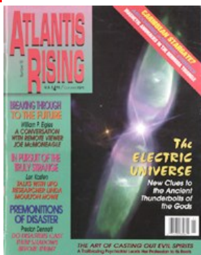
Index of Issue 18