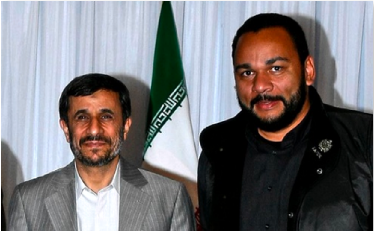
[Image] Men of honor, men of dignity: Dieudonné with living legend Mahmoud Ahmadinejad, former President of the Islamic Republic of Iran and champion of all things truthful.