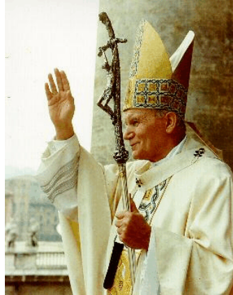
Pope John Paul II

The heathen customs of the clergy of Rome do not end with the zucchetos and tonsures. Alexander Hislop points out: "The two-horned mitre, which the Pope wears, when he sits on the high altar at Rome and receives the adoration of the Cardinals, is the very mitre worn by the priests of Dagon, the fish-god of the Philistines and Babylonians." 399 Notice the bowed crucifix in Pope Paul II's left hand. "I saw, and behold a white horse: and he that sat on him had a bow; and he went forth conquering, and to conquer." Revelation 6:2