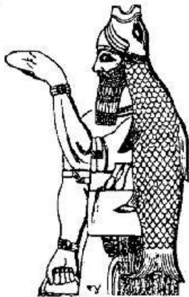
Priest of Dagon