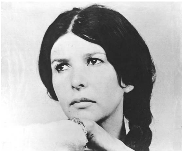
FIGURE 3. Portrait of the filmmaker, ca. 1970.

befriended local children: “There were a lot of poor children of the quartier who would come around because I would sit on the steps and tell them stories.” 45 A few years later, modeling took her to Florida, where a two-week trip turned into two years working for a company called Catalina Bathing Suits, whose salesmen needed “mannequins,” as Obomsawin puts it, to present their lines of swimwear to department store representatives. 46 Because the money was not enough to live on, she took a second job as a nanny in the home of a local family. Working with these children had a side benefit that made the Florida experience worthwhile: by her early twenties, she had learned English from reading to the children in her care. It was her third language after Abenaki and French, and it was the one that she would use for most of her film career.