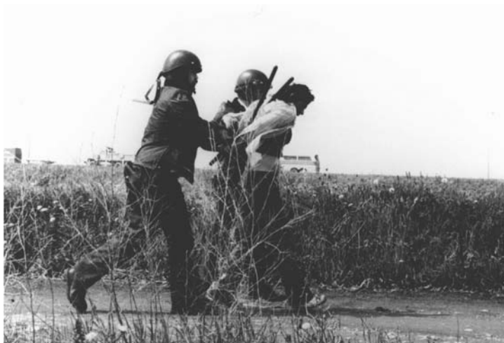
FIGURE 12. Incident at Restigouche (1984). Directed by Alanis Obomsawin. Produced by Alanis Obomsawin, Andy Thomson.

that she rarely made public. “My history at the board has not been easy,” she added. “It’s been a long walk.” 15