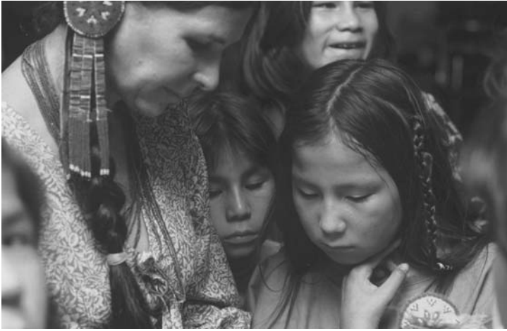
FIGURE 17. Obomsawin during the shooting of Mother of Many Children (1977).