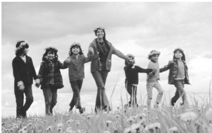
FIGURE 10. Publicity photograph from the making of Christmas at Moose Factory (1971).

In rapid succession, Obomsawin shows us several drawings of a conventional Christmas star, before she mixes in cultural difference, suddenly but unthreateningly, through peals of laughter and two-dimensional images familiar to every parent, uncle, or aunt. As a drawing of an angel appears on-screen, several young voices are quick to tell us that it is no ordinary angel—it is an “Indian angel,” we learn. In a similar maneuver, Obomsawin gives us a standard Christian hymn breaking through the howling wind, before cutting to a Cree-language sermon and a mournful Cree voice singing over acoustic guitar. Conventional expectations for a white Christmas have been gently complicated, allowing Obomsawin’s universalist message to ring through: How different are these children from your own? The message is too subtle to dip into the sentimental treacle that is often slathered across Other children on television, such as those who appear before bloated American celebrities encouraging us to pledge our support for a Cambodian orphan for “the price of a cup of coffee per day.” 1 Instead, Obomsawin provides a more artful evocation of empathy, collective decency, compassion, one that does not cast the children in the role of ill-fated victims.