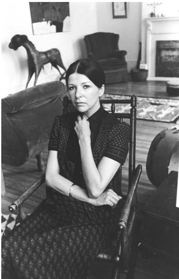
FIGURE 4. Obomsawin in 1971.