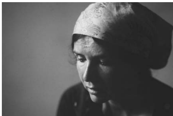
FIGURE 1. Obomsawin in 1971.