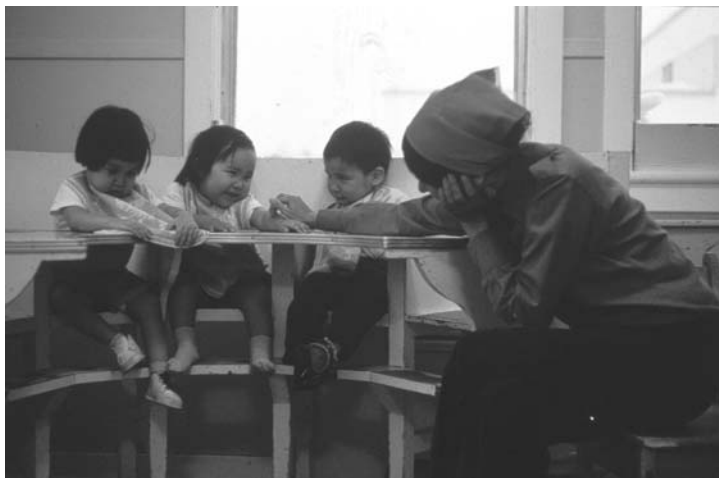
FIGURE 11. Obomsawin in 1967 during the production of Christmas at Moose Factory (1971).

and, in the process, demonstrating the nascent power of indigenous media to Canadian viewers. Because of her early experiences with racism, she had always been ideologically opposed to the reigning systems of thought governing the lives of Native people in North America, but, in the late 1970s and 1980s, she was finding an extraordinary means for combating them. As the political theorist James Scott once wrote: “The main function of a system of domination is to accomplish precisely this: to define what is realistic and what is not realistic and to drive certain goals and aspirations into the realm of the impossible, the realm of idle dreams, of wishful thinking.” 2 During the productive decade beginning in 1977, Obomsawin would show that her documentary agenda for Native people was more than an idle dream, that her traditional Abenaki storytelling voice could be transformed into the realm of cinema, and that indigenous resistance to the orthodoxies of the mass media was both feasible and necessary. The process would begin with her first substantial project, a wide-ranging look at Native women in Canada called Mother of Many Children .