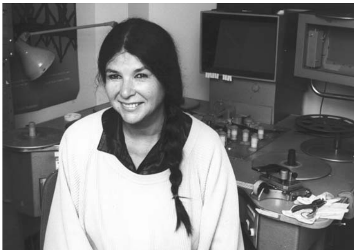
FIGURE 7. Obomsawin at the National Film Board, ca. 1975.

her response was very different from the largely white test audience's. "This film is too important to kill," she told him. "There's just too much in it that has to be shown and discussed." With her encouragement, the film was recut and then released into theaters across Canada in 1972. Although the final product did not set the box office afire, it accomplished what Obomsawin had hoped: it was successful in "bringing whites and Indians looking at the same film together," as Verrall said, and, perhaps with this cross-cultural value in mind, he later asked her to edit down a half-hour version for children's educational television. 65