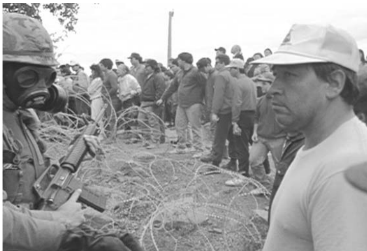
FIGURE 23. Native activists confront armed soldiers in Rocks at Whiskey Trench (2000). Directed by Alanis Obomsawin. Produced by Alanis Obomsawin.

does so without the rancor of an unskilled polemicist. Instead, she demonstrates an uncommon ability to combine passionate advocacy and a gentle, inclusive tone (often conveyed through her calm voice-over narration) and to come across as fair and committed. As a result, she has, I suspect, been able to avoid shutting down less sympathetic viewers, something that is not always true of political films set in Indian country.