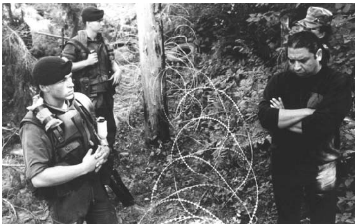
FIGURE 19. Across the razor wire in Kanehsatake: 270 Years of Resistance (1993).

integrity to fulfill these things.” The camera pans toward Siddon and the other officials smiling awkwardly. The scene evokes the European paintings of treaty signings from the eighteenth century, except now the Natives are talking back, speaking for themselves, putting the federal officials on the spot rather than posing mute on the canvas.