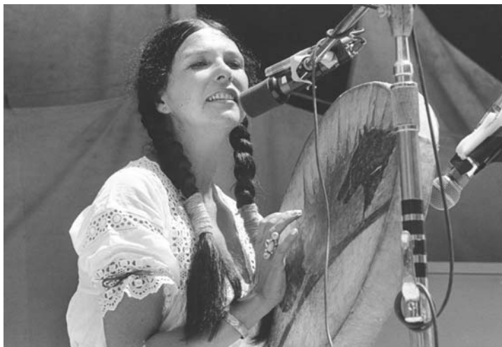
FIGURE 15. Obomsawin performing traditional Abenaki stories and songs, ca. 1970.