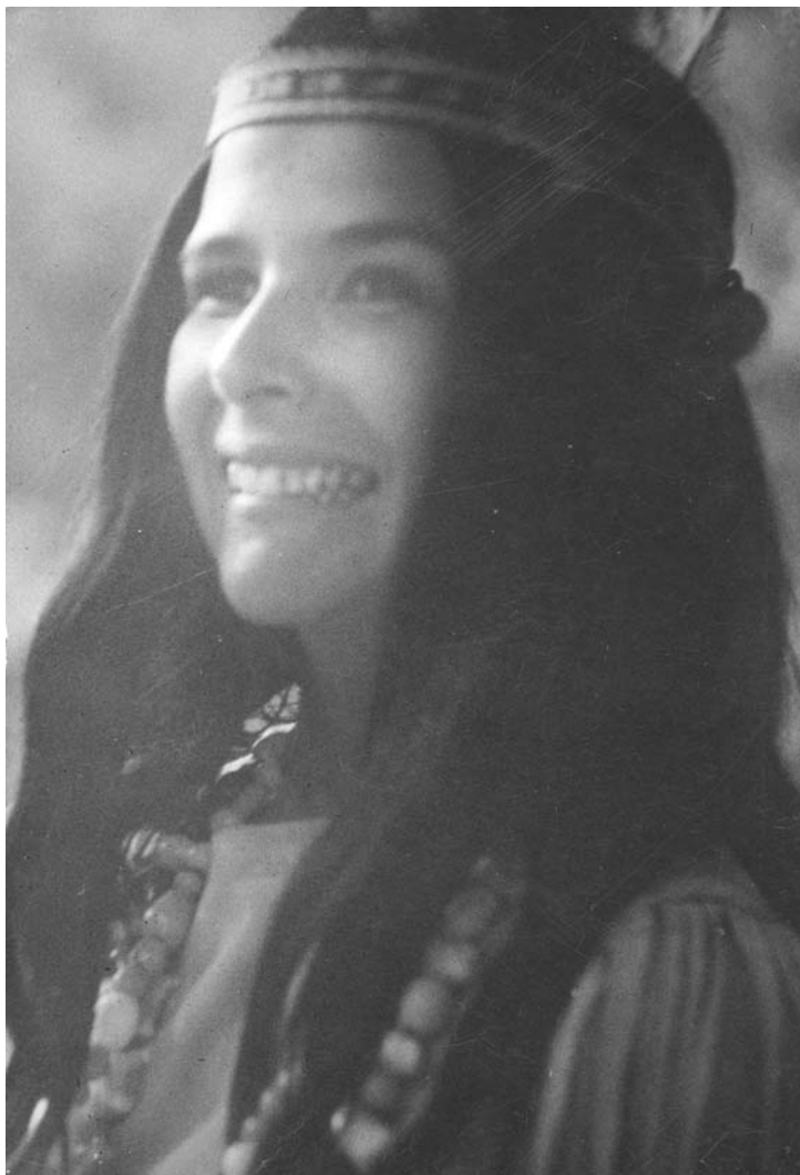
FIGURE 2. Obomsawin at a celebration in Odanak in 1969.