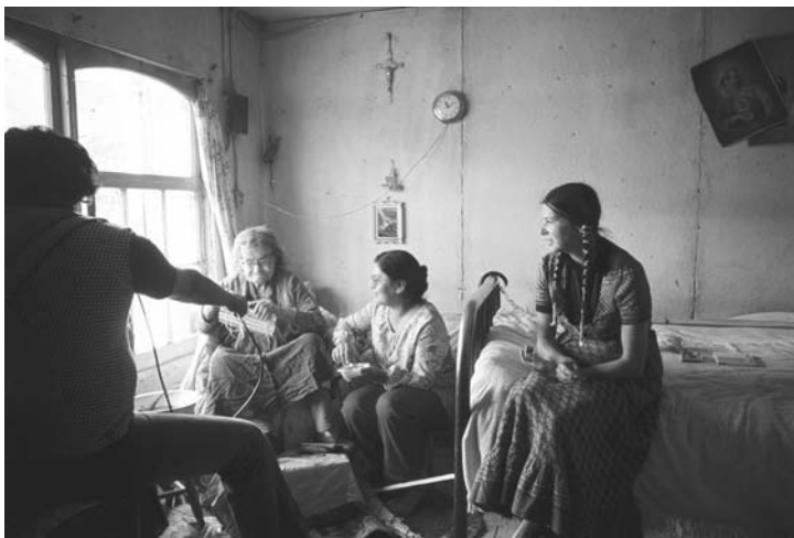
FIGURE 8. Obomsawin during the making of L'Ilawat educational kit for the National Film Board, ca. 1975.

nonfiction film. What was most exciting to her about the kits was getting Native people involved in the development of such classroom resources, often for the first time in Canadian history. “Just to think that now a teacher would actually use our material and our voices for teaching,” Obomsawin later said with astonishment. “It was such a victory.” 66 Although the kits were intended for use in primary schools, they were soon popping up in universities and other unexpected settings, in part because they were well made, and in part because of the paucity of “Native voices” then available in instructional media.