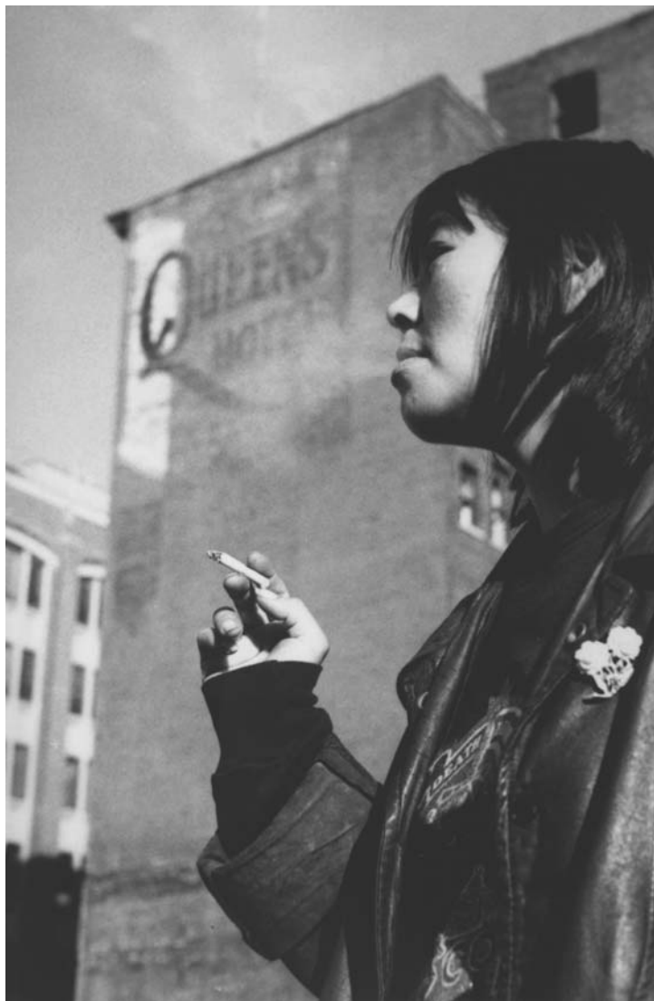
FIGURE 14. No Address (1988). Directed by Alanis Obomsawin. Produced by Marrin Canell, Alanis Obomsawin. © 1988 National Film Board of Canada. All rights reserved. Photograph by: Audrey Mitchell. Photograph used with the permission of the National Film Board of Canada.