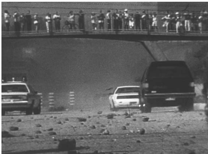
FIGURE 22. Mohawk families running a gauntlet of rocks, bottles, and racist epithets in Rocks at Whiskey Trench (2000). Directed by Alanis Obomsawin. Produced by Alanis Obomsawin.

provides a scathing indictment of white Canadian racism, including the racism of the mainstream media. “Many reporters covering the situation in Montreal had anti-Mohawk views,” Obomsawin has said. “When they announced that the cars were on the bridge, they told people to get down there and stop them [the Mohawks] from escaping.” 31 A passionate and compelling film, Rocks at Whiskey Trench represented yet another attempt to depict the crisis from a Native point of view, although the passage of years had given Obomsawin an additional sense of urgency. “I felt very bad that a lot of people had died since the experience,” she said, before explaining her rationale behind the four documentaries dedicated to showing the world what had happened at Oka. “It’s for other generations to have an idea of what happened.” 32