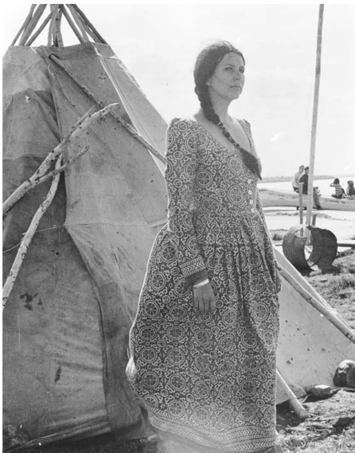
FIGURE 9. Obomsawin in Yellowknife at a conference on education, ca. 1971.

her work, has not received the attention it deserves, even though it was one of the early films that set the pattern for her more celebrated projects. Like all her artistic work, her first documentary had its roots in the painful lessons of her early life: a profound sensitivity to cross-cultural affliction and how it shapes the lives of Native people as well as the possibility of transcendence through creativity, communication, and compassion. In stepping into the realm of documentary film production at the tail end of the 1960s, Obomsawin had found the ideal place to test these lessons.