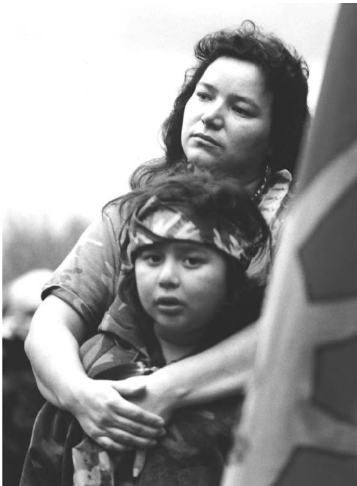
FIGURE 20. My Name is Kahentiiosta (1995). Directed by Alanis Obomsawin. Produced by Alanis Obomsawin. Photograph taken from the production.