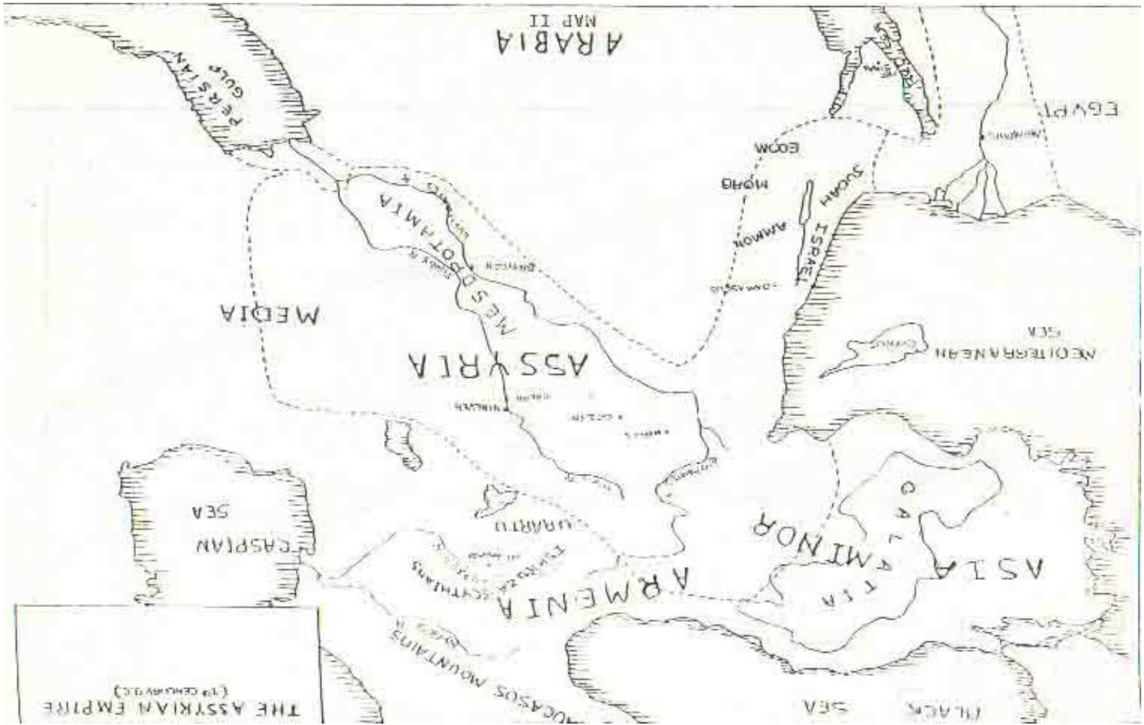
THE ASSYRIAN EMPIRE (7th CENTURY B.C.)