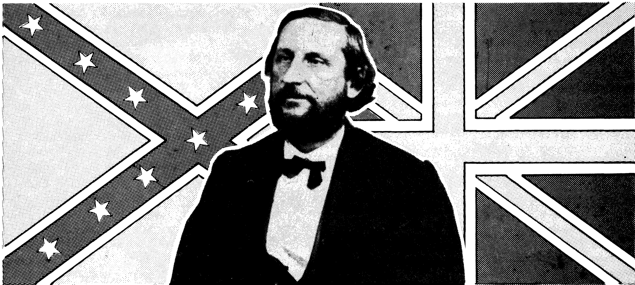
Judah Benjamin, Confederate leader, controller of B'nai B'rith, funder of the KKK

trol." An indication of the source of his messianic zeal is that Sabbatai's father had been for years in contact with certain British merchants seeking to break open the Turkish Empire's control over the Near East.