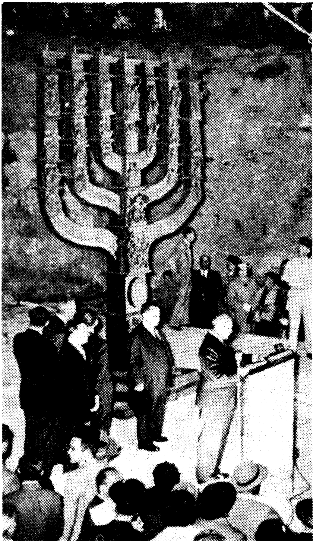
The dream realized: installation ceremony for a huge menorah presented to the newly formed Israeli government by Britain.

Regeneration,” Churchill concluded with a personal appeal to Montefiore as the “most likely to take the head in such a glorious struggle for national existence.”