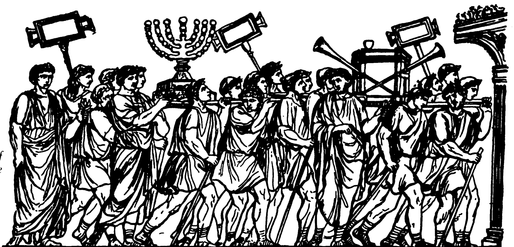
A drawing of a bas-relief showing the Looting of the Temple