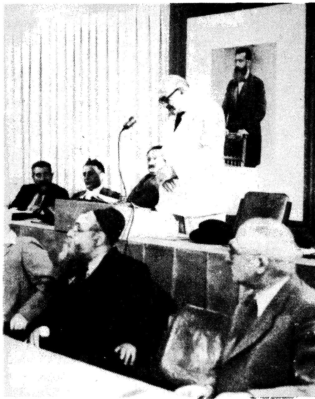
Zionist leader Chaim Weizmann addresses the Israeli Knesset, as its first president. Like Theodore Herzl, whose portrait hangs behind him, Weizmann concurred with the most vicious anti-Semites. Europe’s Jews “must meet their fate,” he said in 1937. “Only a branch will survive. They must accept it.”

Given that Benjamin Disraeli’s novels like Coningsby (1844) and Tancred (1847) were proclaiming the superiority of the Aryan-Semitic “race,” it is obvious where such “ideas” originated. Oligarchist Count de Gobineau’s Essay (1853), for example, had the following