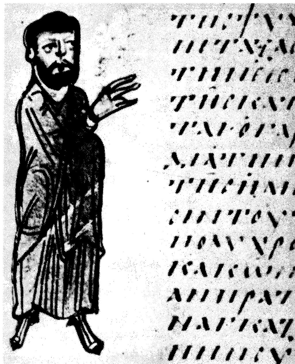
Philo Judaeus, as depicted in a ninth-century manuscript

To achieve his goal, Philo outlined the process of individual spiritual perfection that each soul must pass through in order to become, like Philo, a "citizen of this whole world." The uplifting of the souls of the masses from beastlike to godlike was the the passionate commitment of Philo. As a model, Philo suggested that men take as their ideal the concept of "becoming like unto God."