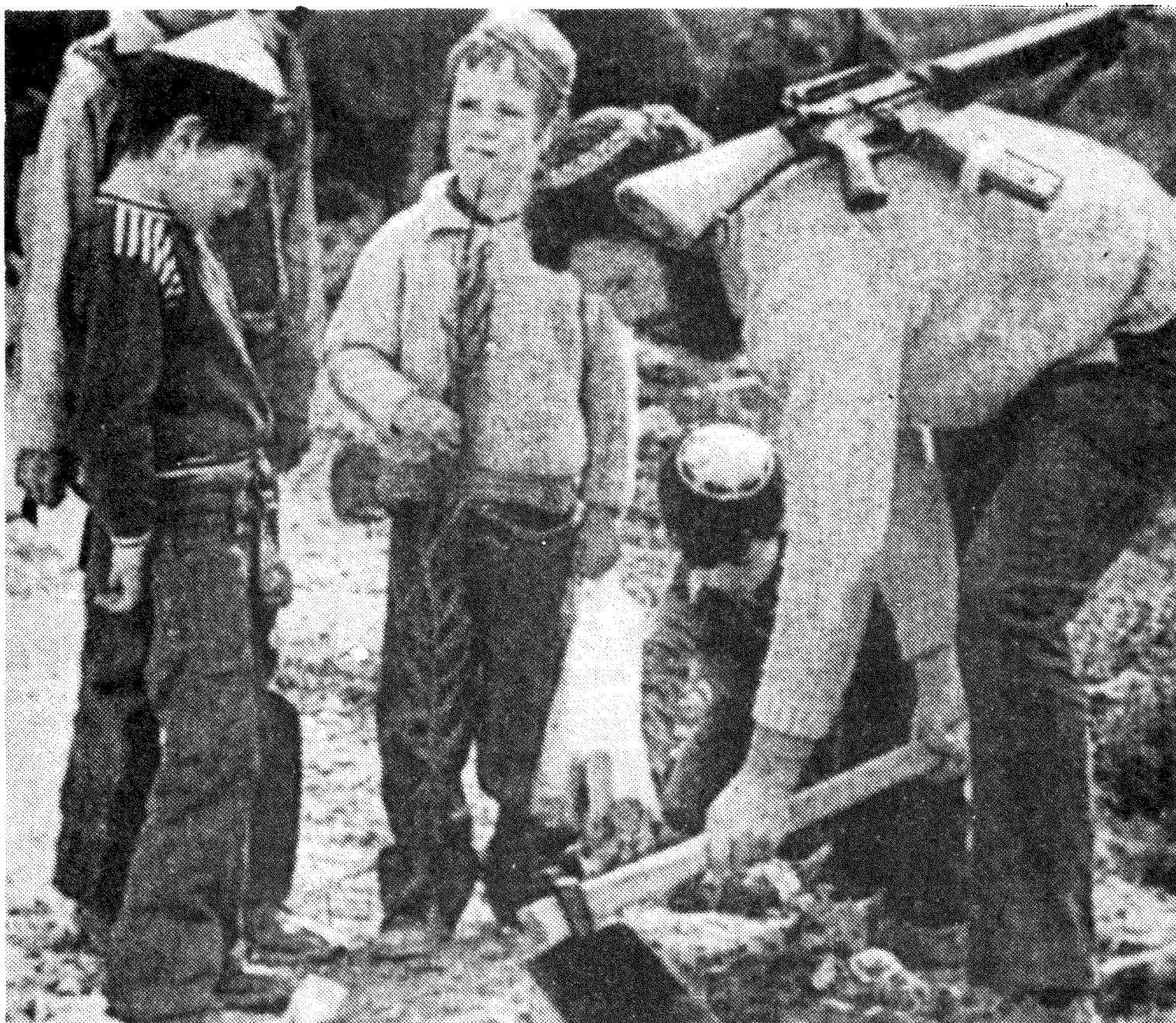
A tree is planted in memory of Masada

The Zealots, a terrorist organization, arose to provoke a bloodbath in Palestine. From every piece of evidence, the Zealots were a direct creation of the Egyptian Isis cult