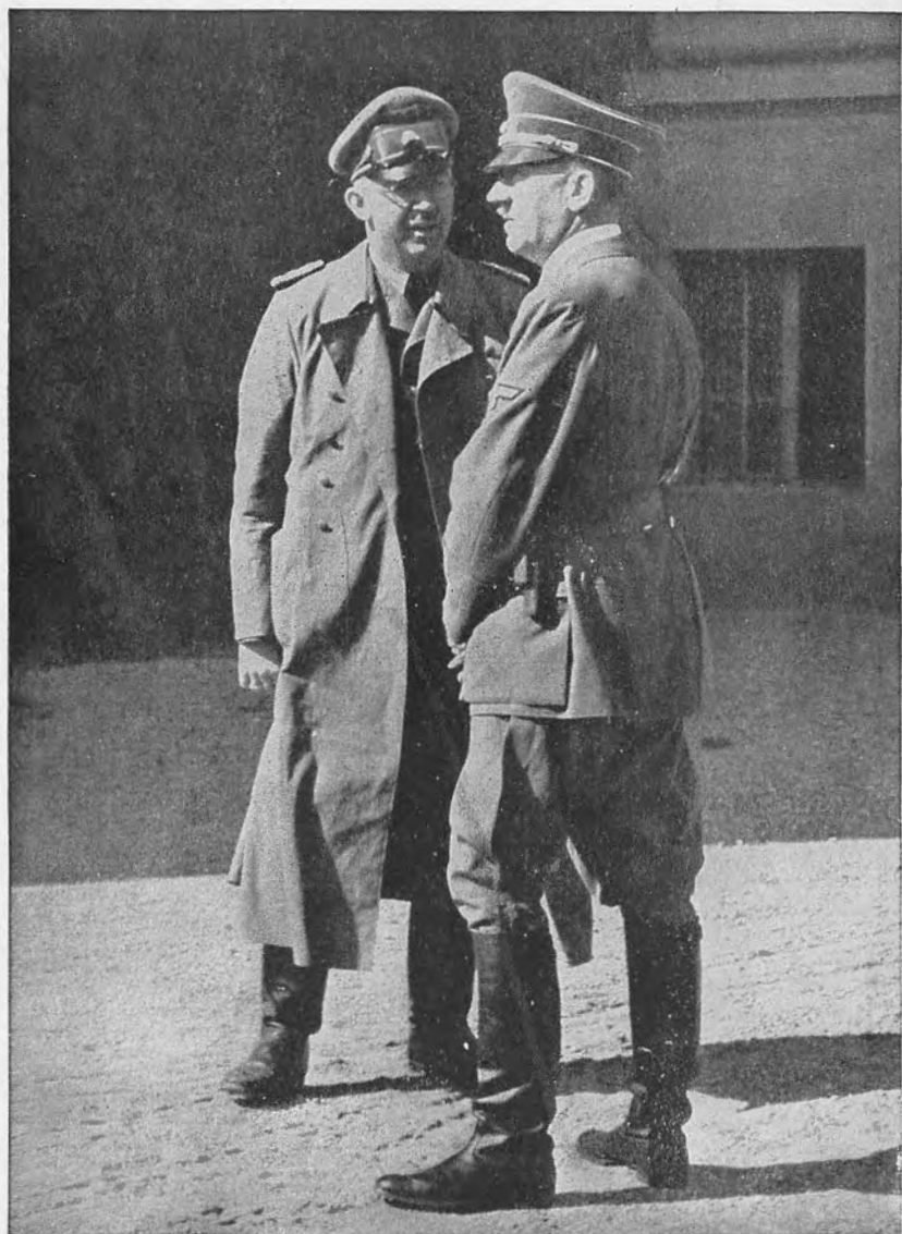
HITLER AND HIMMLER (Captured photograph from S.S. Hauptamt)