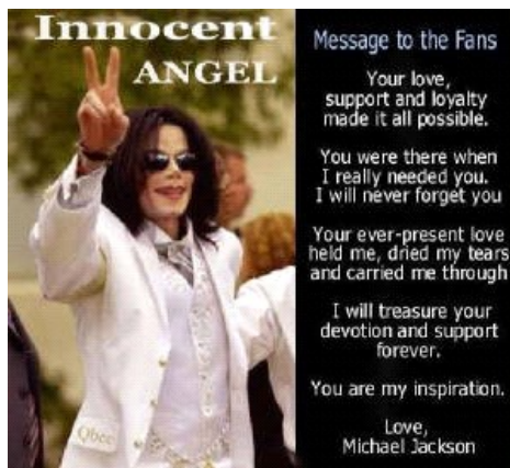
The false charges against him were leveled by a greedy con man, a welfare Queen, and the media.

Was the character assassination of 'The King of Pop' (and perhaps even the curious drug overdose given to him) related to his admiration of Hitler and known 'anti-semitism' towards the Big Jews of the music industry? OF COURSE IT WAS!