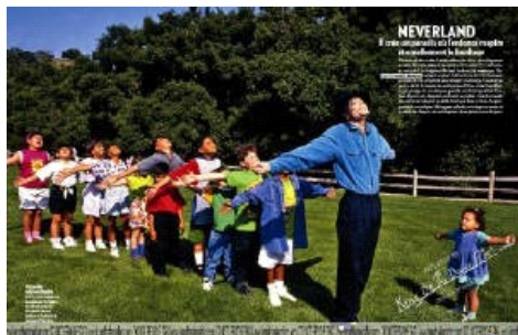
Jackson loved children. He only surrounded himself with them to make up for his own lost childhood.

** "Out here...Michael Jackson is being literally crucified...I think if you did a pulse poll, of people listening to these local talk shows, they would say 95% that Michael Jackson did all this...because it's based on the coverage. " - Matt Drudge (The Drudge Report)