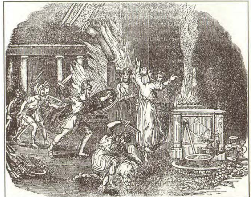
Pompey and his army slaughtering the Jews on their Sabbath

The Roman historian Dio Cassius, in speaking of Pompey's attack of Jerusalem, say that if the Jews "had continued