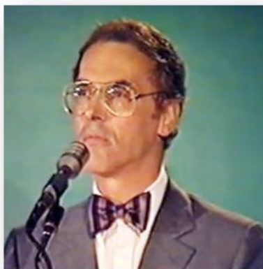
Bernard de Montréal