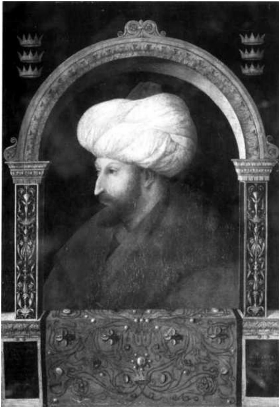
1. Mahomet II, the sultan of the conquest of Constantinople in 1453.

today Montenegro, the armies of King Lazar met as the invading Turks of Sultan Murad halted under the mountains of Kosovo. The two sides faced each other over the tiny rivulet of Schinitza that separated the two camps, and Murad wondered whether he should attack the Christian armies that seemed so much larger than his.