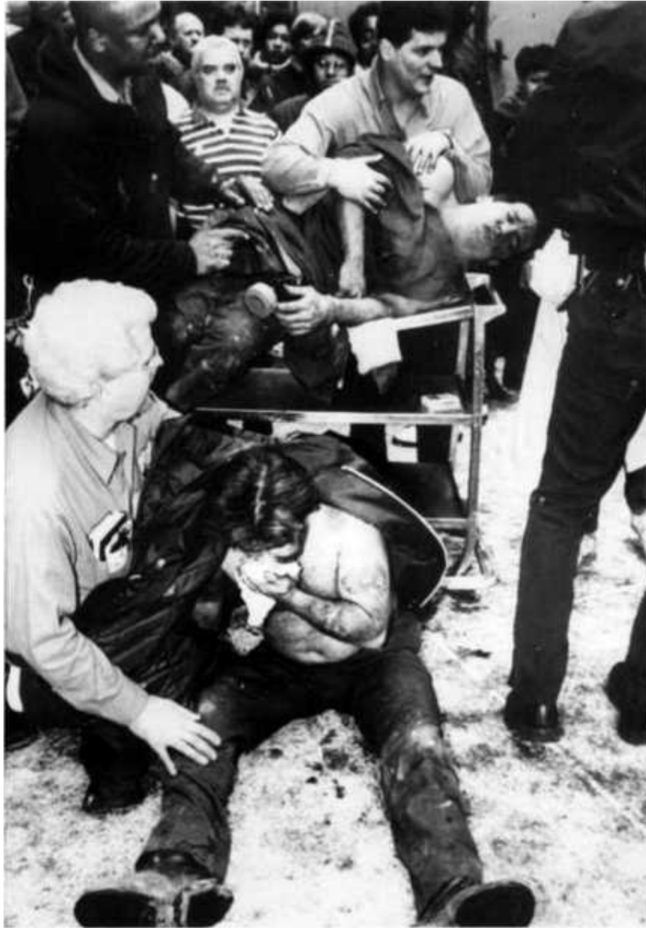
8. Victims being treated at the scene of the bombing of New York's World Trade Center on February 26, 1993. The bombing killed six and injured over a thousand. Six months after the blast, U.S. prosecutors obtained a massive indictment against the charismatic Muslim preacher Sheik Omar Abdel Rahman and fourteen followers.