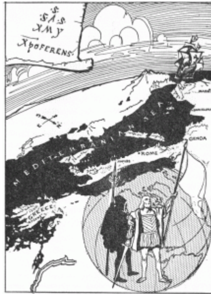
The cipher signature of Columbus (reproduced above) is generally interpreted Salve Christus, Maria, Yosephus-Christoferens . It was usual to build personal ciphers upon dates. If the seven large letters above the signature are read according to the medieval system of numeration the date 1420 results. The "x" appears to be a double letter composed of "jx"; this would increase the sum to 1430. Is this then the true and unknown birthdate of the Greek navigator?