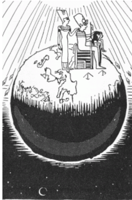
Akhnaton, Pharaoh of Egypt, born 1388 B. C., was the first man in recorded history to exemplify social consciousness in the administration of a great nation. He saw every living thing as having a divine right to live well, to hope and to aspire in a world governed by brotherly love

The leader who had the first social consciousness in the administration of a nation was a Pharaoh of Egypt, Akhnaton. ... Born several thousand years too soon, he was the first realist in democracy, the first humanitarian, the first internationalist. ... He saw that the duty of the ruler is to protect for all the right to live well, to think, to dream, to hope, and to aspire. ... For his dream of the Brotherhood of Man he cheerfully gave his life.