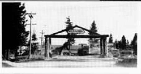
Nevada Historical Society