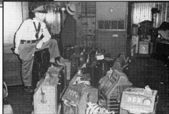
Police raid a slot machine distributor.