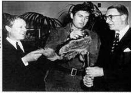
Senator Estes Kefauver (r.) discussing coonskin caps with television's "Davy Crockett," actor Fess Parker (c.).

University of Tennessee at Knoxville Kefauver Collection