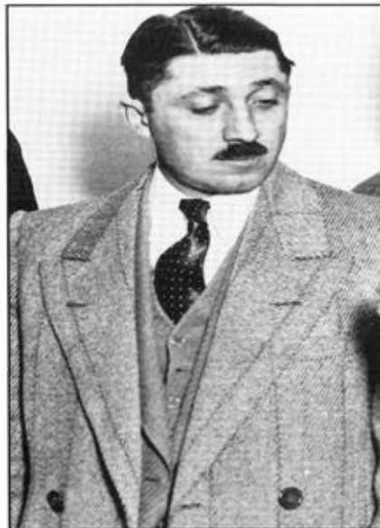
Frank "The Enforcer" Nitti (1932)