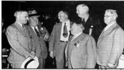
Senator Harry S. Truman (l.) with his sponsor Tom "Boss" Pendergast (second from left) at the 1936 Democratic National Convention in Philadelphia.