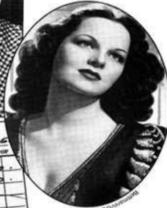
Virginia Hill, the Outfit's courier, in a 1947 Hollywood glamour shot.