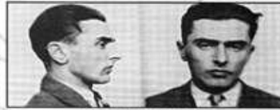
Early mug shot.