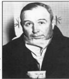
Johnny "The Fox" Torrio, recovering from wounds suffered during the 1925 Chicago beer wars.