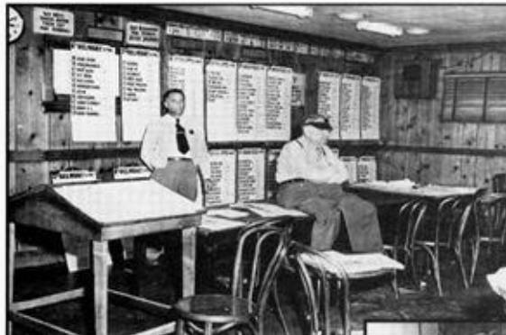
A typical Chicago "handbook" joint.