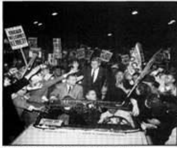
Senator John F. Kennedy, campaigning in Chicago, with Mayor Richard Daley seated to his left (November 4, 1960).