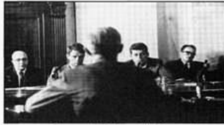
Counsel Robert F. Kennedy and Senator John Kennedy give rapt attention to a witness before the McLellan Committee.