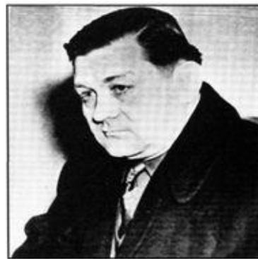
George "Bugs" Moran