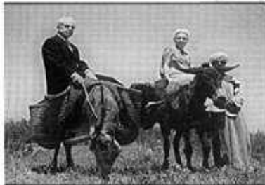
—and on tour in the Middle East.