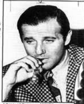
Benjamin "Don't Call Me Bugsy" Siegel.