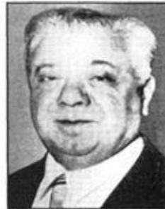
John "Jake the Barber" Factor, on the day he was released from his "kidnappers" (July 7, 1933).