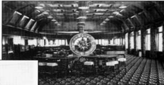
Nevada Historical Society