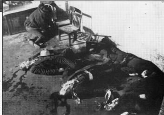
The St. Valentine's Day Massacre, February 14, 1929.