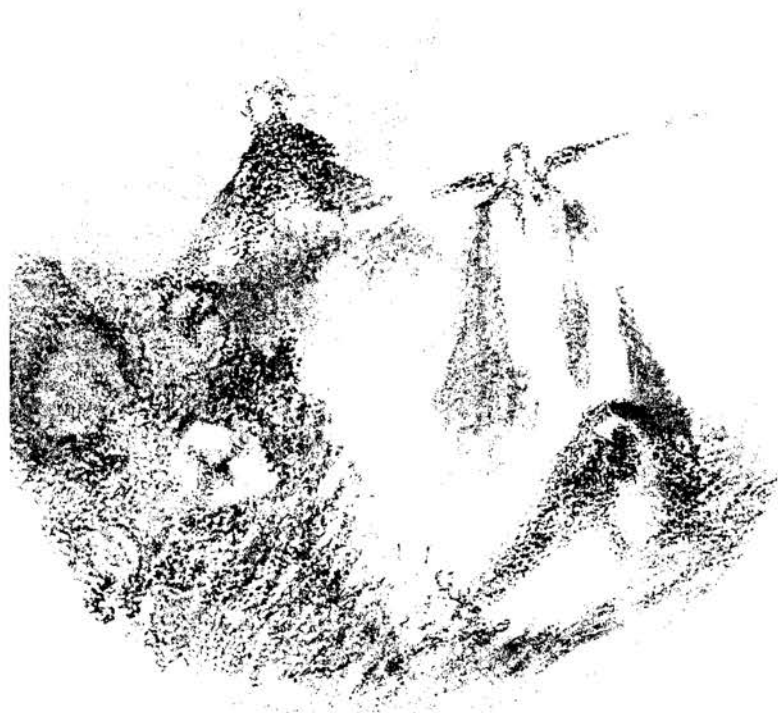
In this pastel sketch by Rudolf Steiner, the working of cosmic forces into the still heavy and mist-laden atmosphere of Atlantis is shown as guided by god-like angelic beings. Out of the downward streaming colours are born the types of the lion, cow, and bird (left), while to the right a kind of cave unfolds inner life and form. (Preliminary sketch for the large cupola of the Goetheanum ceiling, Dornach, Switzerland).

matured in order to develop an inner consciousness of self. At length, the fourth age arrived. At this stage something of tremendous importance took place, which had been prepared by all that had previously happened.