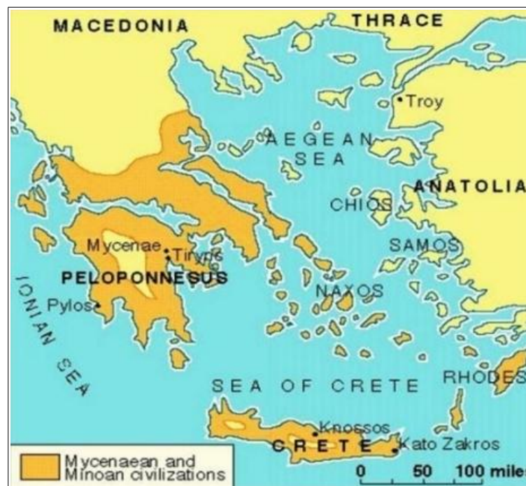
The Minoan and Mycenaean civilizations, around 1800-1400 BCE.

The Achaeans settled in Greece, establishing themselves as the dominant caste, without at first reaching Crete. The first destruction of the Minoan palaces (around 1700 BCE) was probably due to a large earthquake of which there is evidence; not Achaean invasion.